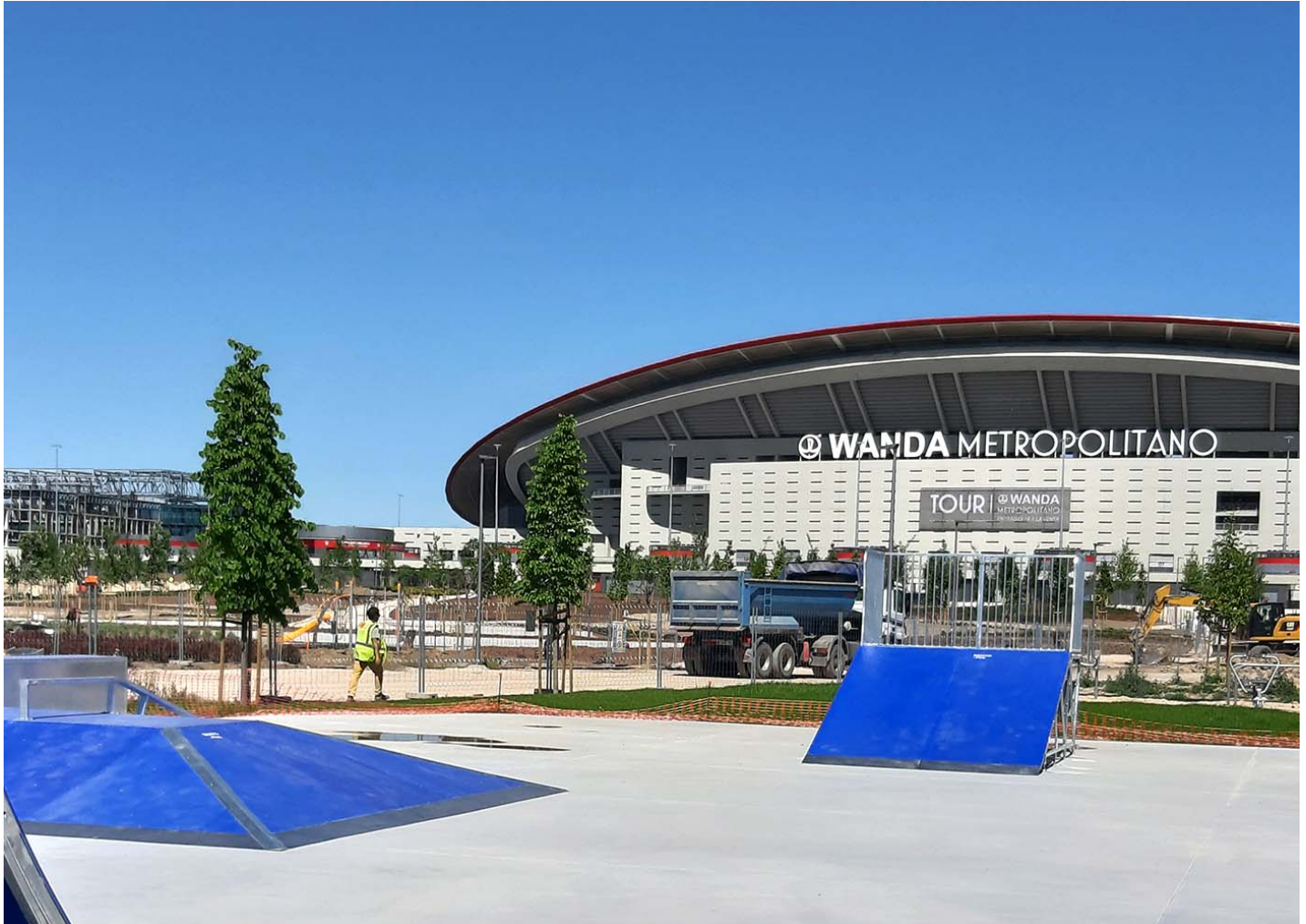
Bank 125 JSK1006-K

The neighbours of the Atlético de Madrid stadium, in the district of San Blas-Canillejas, benefit from a skate park by BENITO as well as areas for rest and leisure.