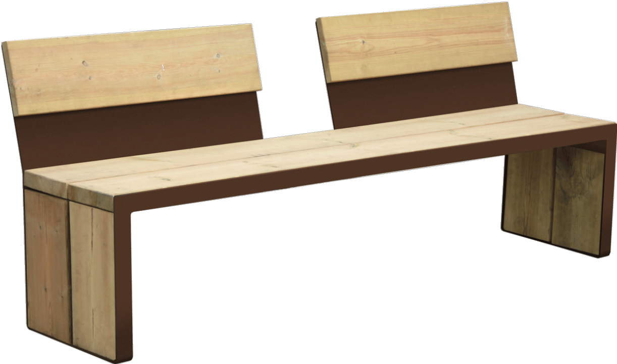
Tor ReBnew UM353PR