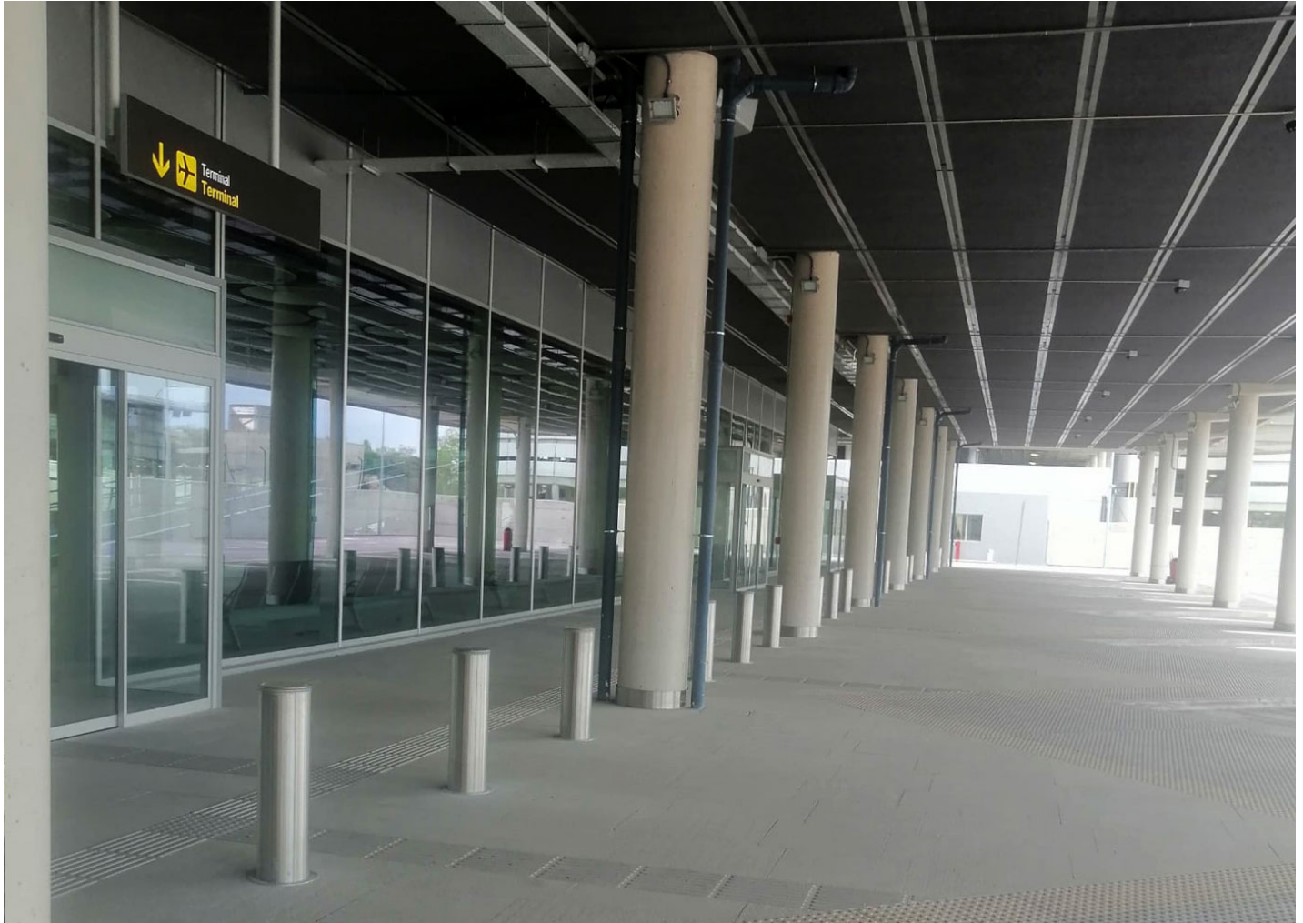
Automatic Telescopic Ø220 x 600 mm H6008

High-security automatic and fixed bollards with LED filled with concrete in the new bus terminal of the Barajas Airport T4 to increase security while preventing vehicle access.