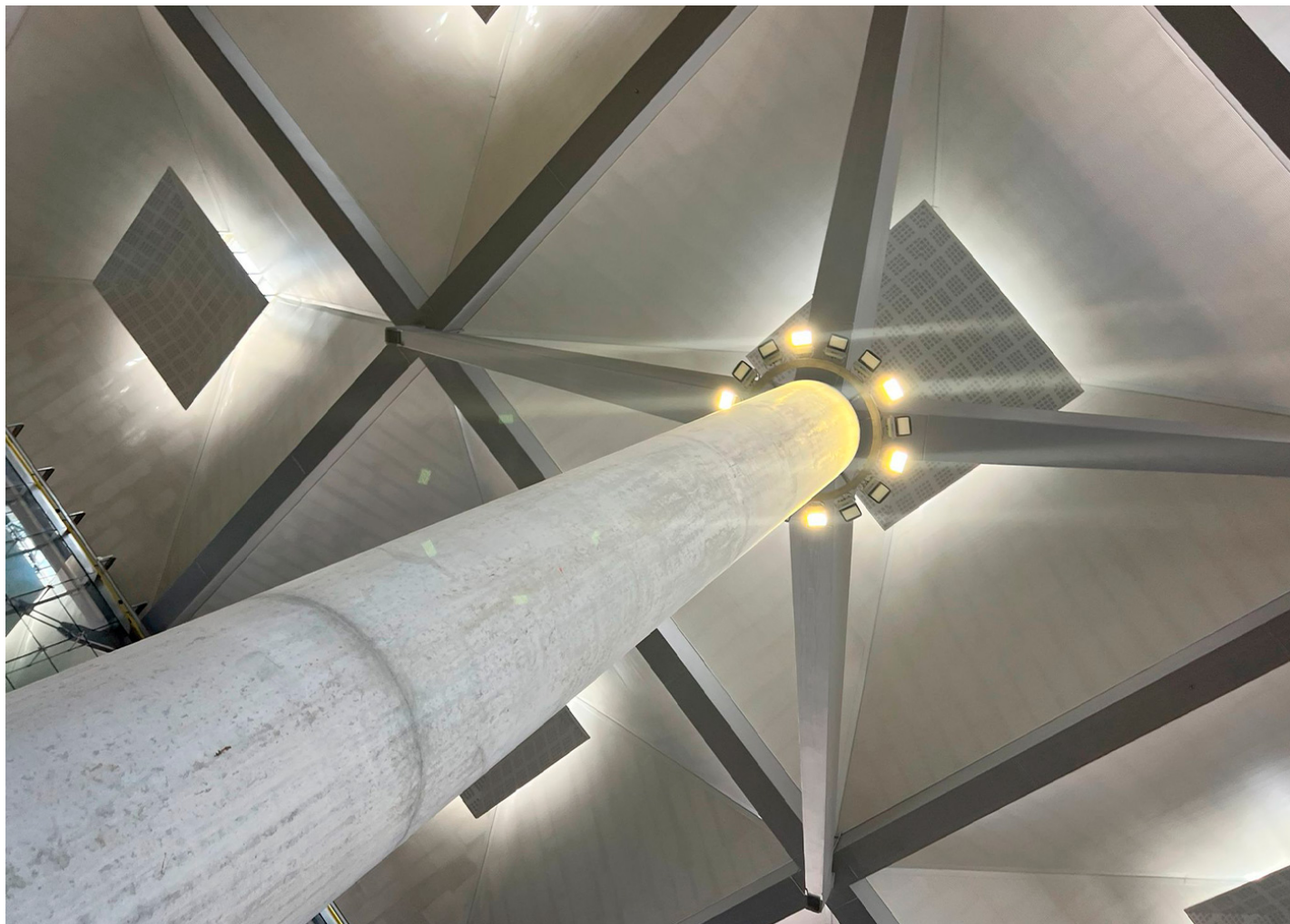
Milan XL APMXL

The Málaga-Costa del Sol Airport, equipped with Milan floodlights, one of our floodlights with the largest power range and extensive light distributions to cover all applications.